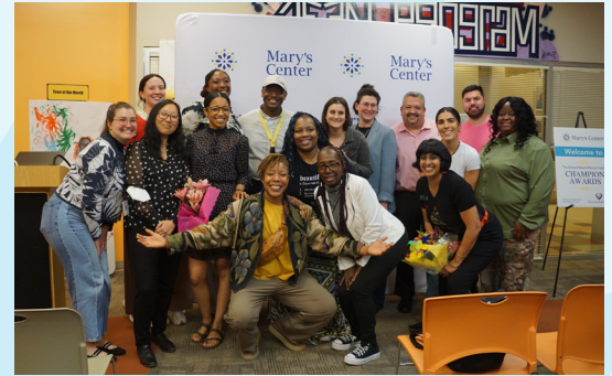
School-Based Mental Health program staff with DC school staff members.

Our on-site therapists offer immediate emotional support, assist teachers with challenging situations, and connect families to essential resources—bridging education, healthcare, and social services to make mental health support more accessible and impactful for students.