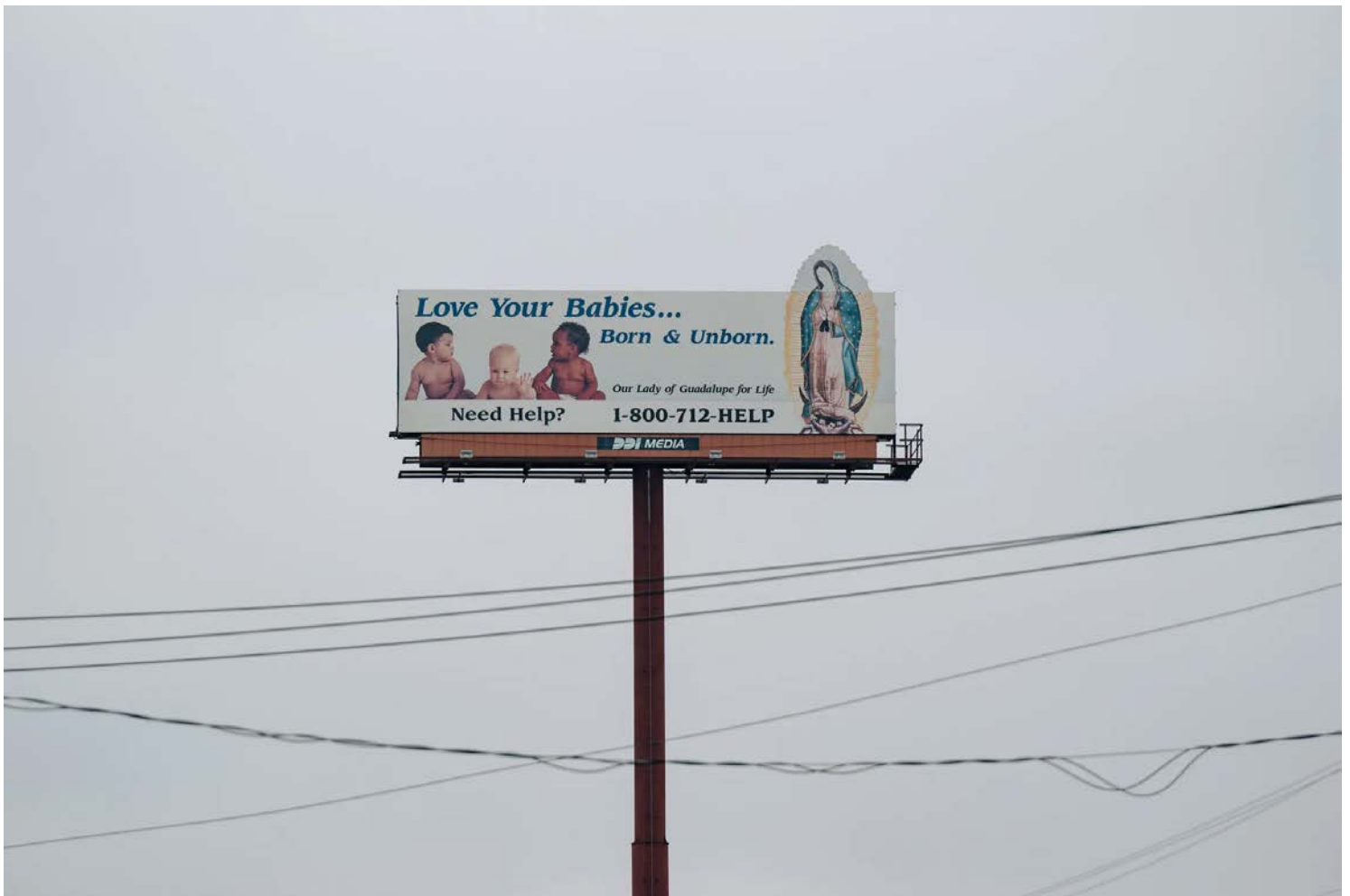
Abortion does not appear to have driven the decline in teen births.