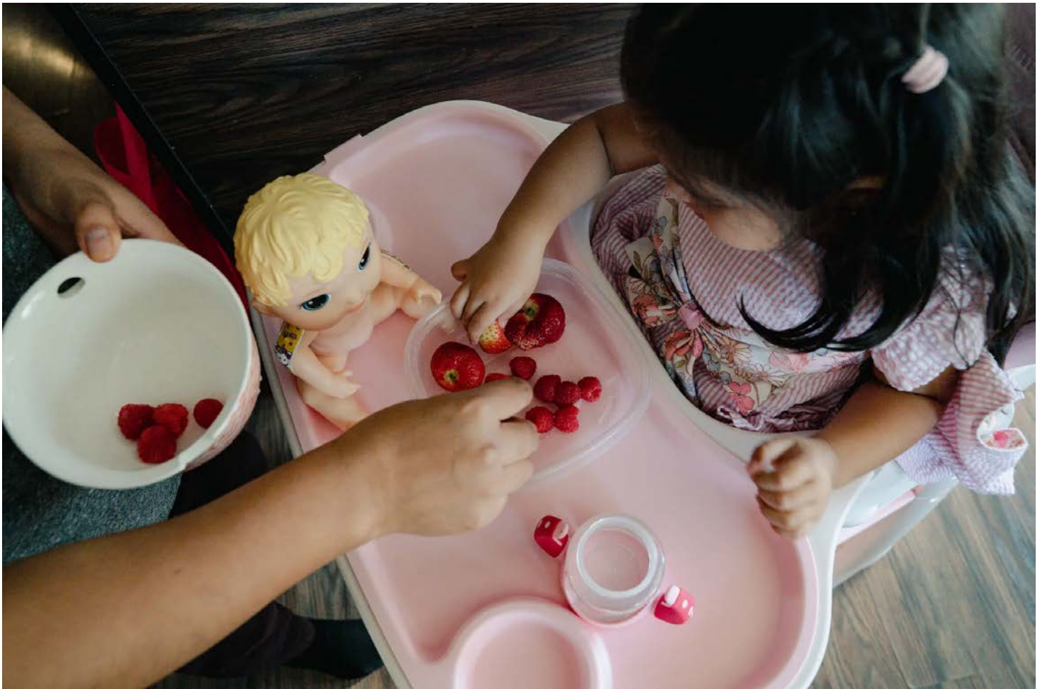
Teen births have fallen by 77 percent since 1991, and among young teens the decline is 85 percent.

The decline is accelerating: Teen births fell 20 percent in the 1990s, 28 percent in the 2000s and 55 percent in the 2010s. Three decades ago, a quarter of 15-year-old girls became mothers before turning 20, according to Child Trends estimates, including nearly half of those who were Black or Hispanic. Today, just 6 percent of 15-year-old girls become teen mothers.