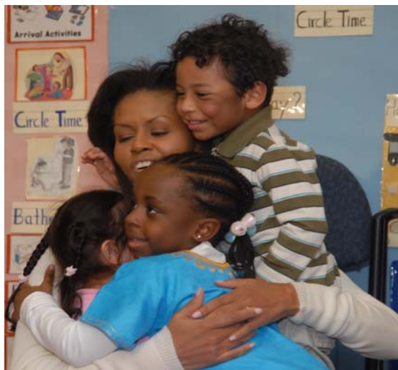
First Lady, Michelle Obama—Feb. 2009

Medical, mental health and oral health services, family social services, adolescent programs, early intervention programs for children with disabilities, health promotion and disease prevention education, home visitation, and family literacy programs, etc.