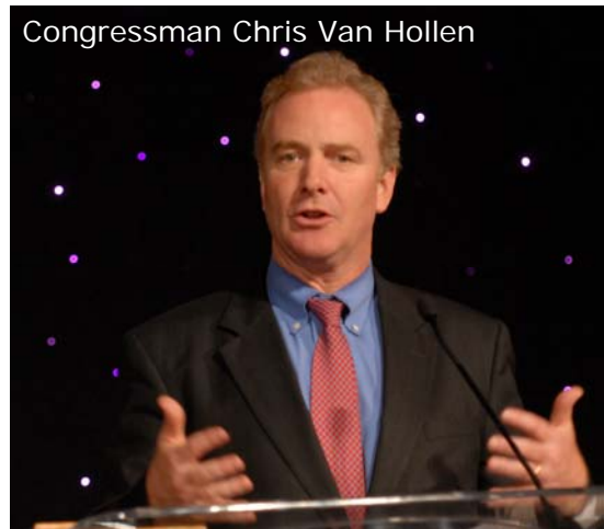
Congressman Chris Van Hollen

Mary's Center acknowledges our sponsors, government officials, community leaders and old time friends for helping to make this fantastic celebration a success.